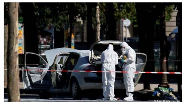
Free Malaysia Today

The car contained an AK-47 assault rifle, handguns, and a gas canister. The attack vehicle also contained a quantity of explosives sufficient to blow this car up.