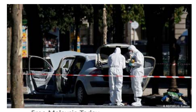
Free Malaysia Today

The car contained an AK-47 assault rifle, handguns, and a gas canister. The attack vehicle also contained a quantity of explosives sufficient to blow this car up.